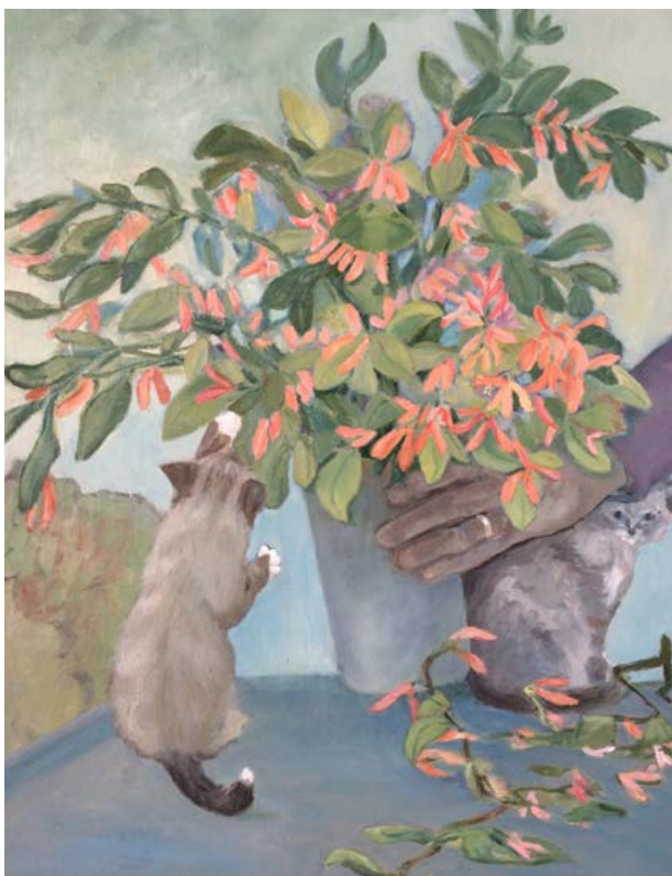
Kittens/Vase of Honeysuckle by Holly Nelson